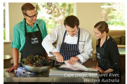
Cape Lodge, Margaret River, Western Australia