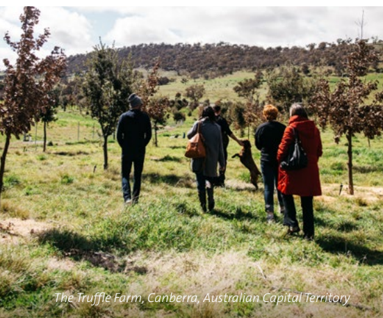
The Truffle Farm, Canberra, Australian Capital Territory