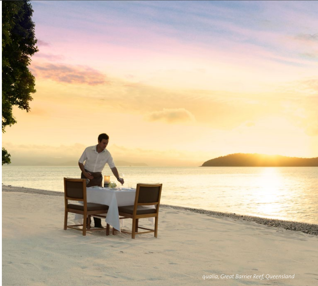
qualia, Great Barrier Reef, Queensland