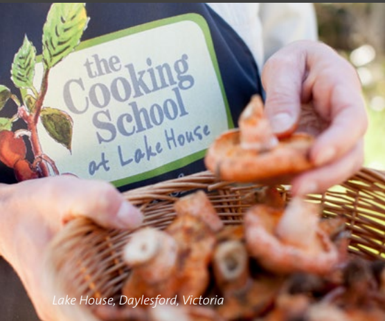
Lake House, Daylesford, Victoria