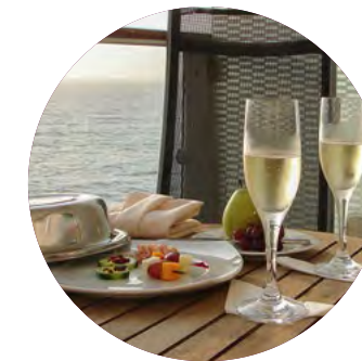
Sunset cocktails and gourmet bites delivered to the wedding couple's room daily.