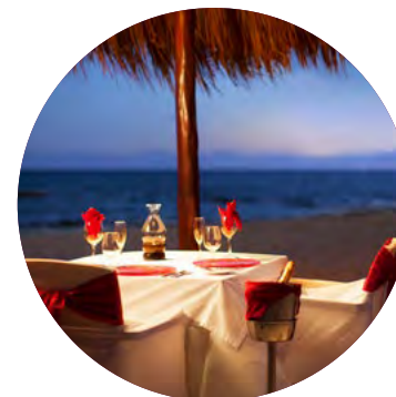
Private Candlelit Dinner on the Beach

and we will send you off in the right direction with these luxury honeymoon inclusions: