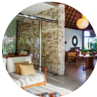
Private hotel check in for the group.