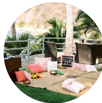
Kids Only lounge at the reception, which is a designated, staffed area near the reception with fun things for the kids to do.