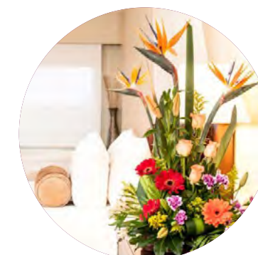
Fresh Tropical Flower Arrangement in Room