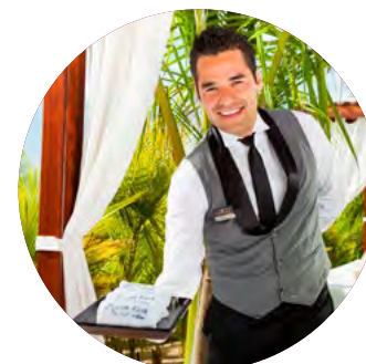
Cold towel service upon arrival to ceremony embroidered with wedding couple's name and wedding date.