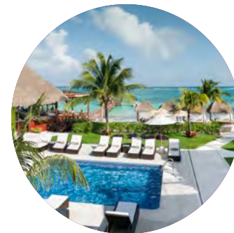
Pool or beach section reserved for the group daily with a personalized sign.