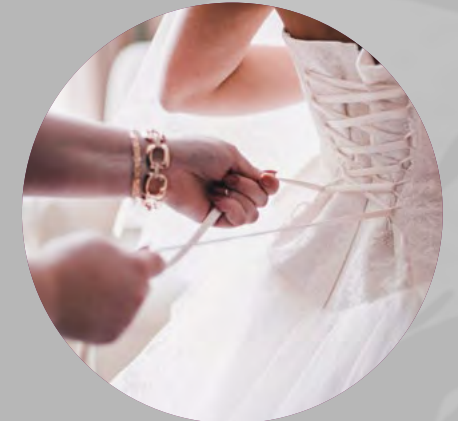
Personal, On-site Wedding Attendant During Your Entire Stay.