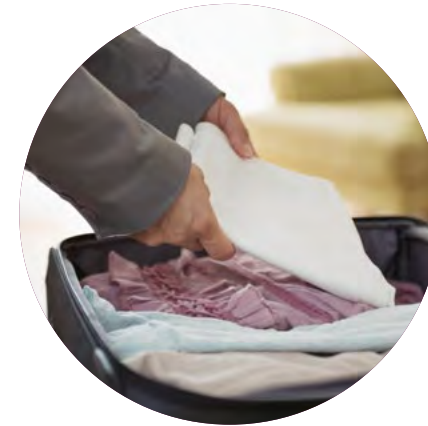
Packing and unpacking services.