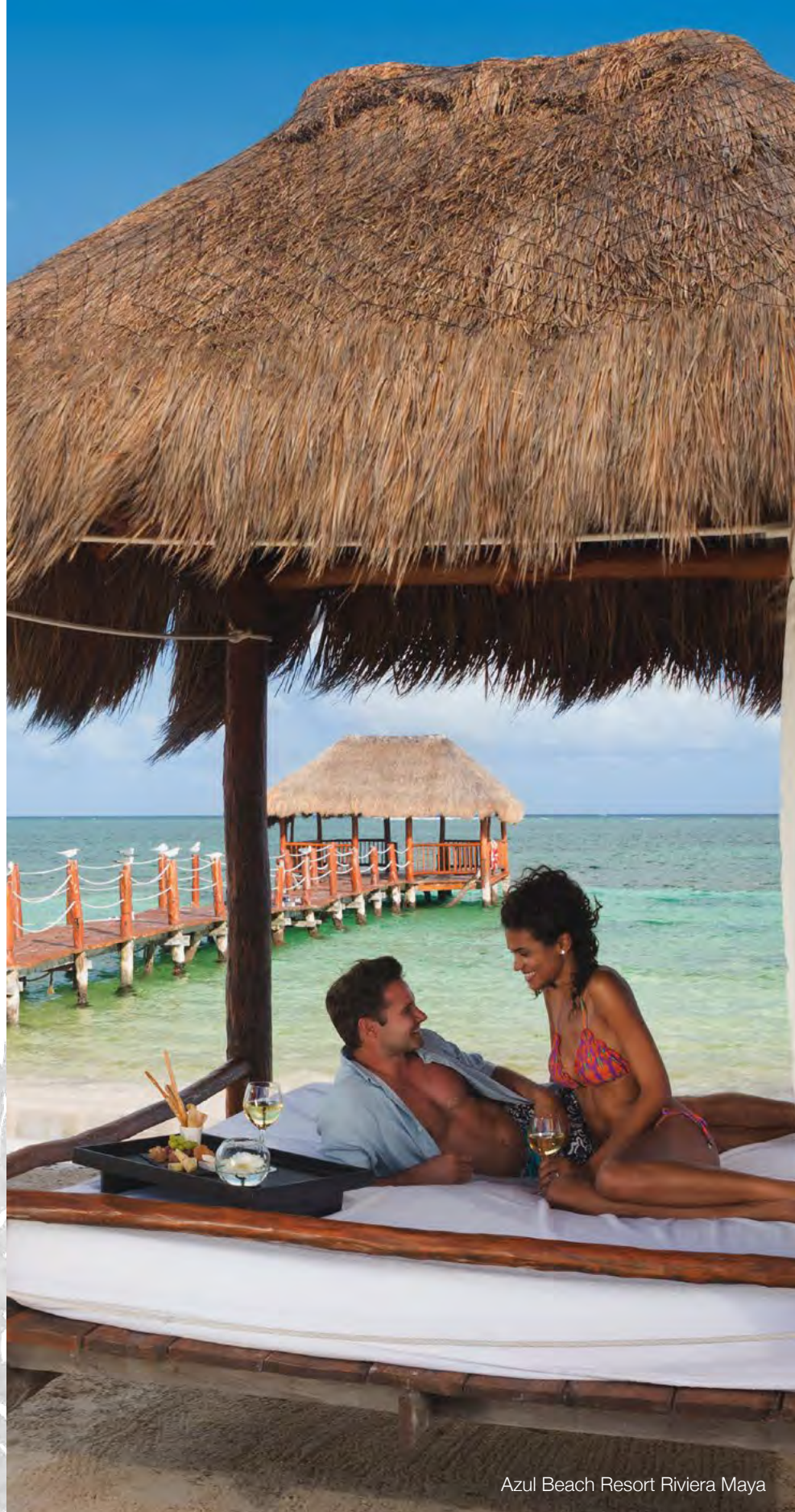
Azul Beach Resort Riviera Maya

The pampering doesn't end after you say, "I do." We will spice up your stay even more with honeymoon services and amenities that are the ideal complement to the wedding you will never forget.