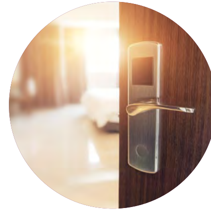
Private in-suite check in.

Experience these elevated services and amenities for the Exclusively You couple: