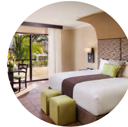
Groom's room to stay in the night before the wedding (pending availability).