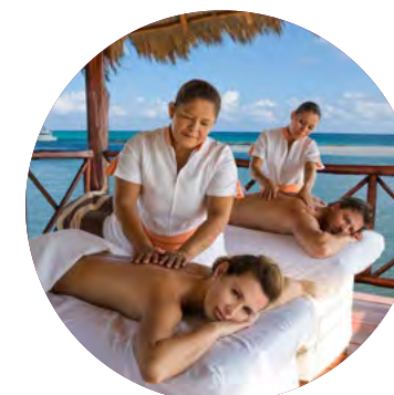
2 for 1 Sky Massage