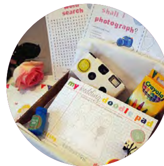
Kids Wedding Activity Pack, which includes items such as an I Spy Disposable Camera Kit, bubbles, a wedding themed coloring book, crayons, sand toys, and treats.