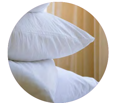
Premium pillow and aromatherapy selection.