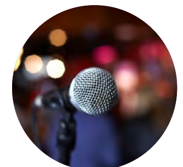
Sound System with Microphone