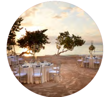
Private Beach Reception Location