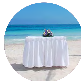
Altar Table with White Linen