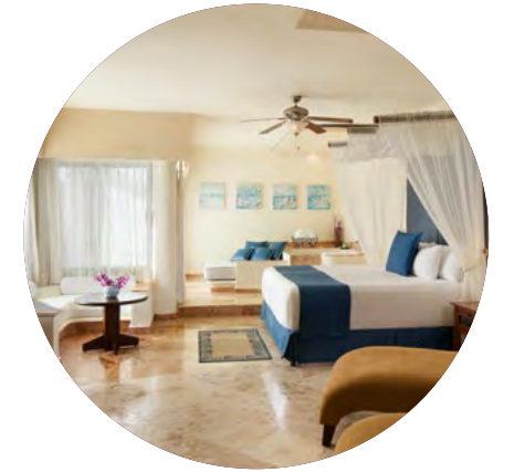
Free suite upgrade to the next category (pending availability).