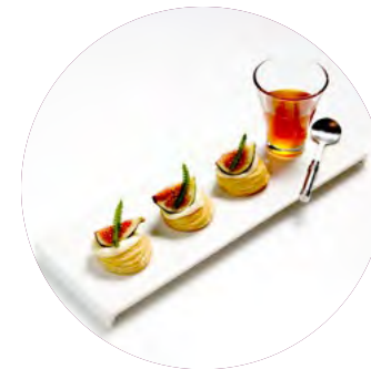
Nightly turn down service for the wedding couple.