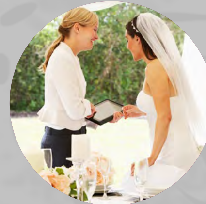
The Dedicated Services of a Signature Wedding Designer™.

Gain priceless peace of mind with these inclusions for effortless planning: