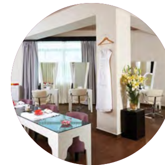
Bridal spa suite day of ceremony for the women to get ready in, stocked with Mimosas and gourmet bites.