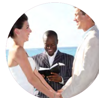
Non-Denominational Minister or Judge