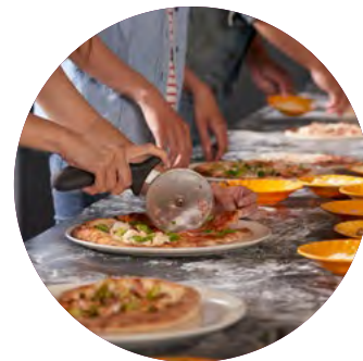
One group cooking class to enjoy together.