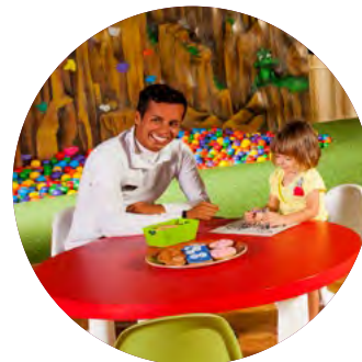
Kids Concierge to coordinate activities specific to the wedding group including a Pastry Chef in Training activity & wedding themed arts & crafts.