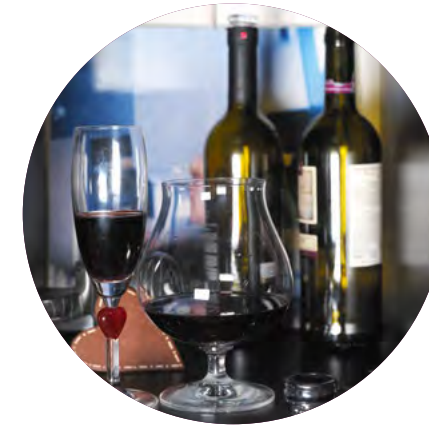
In-suite bar stocked to your personal preference.