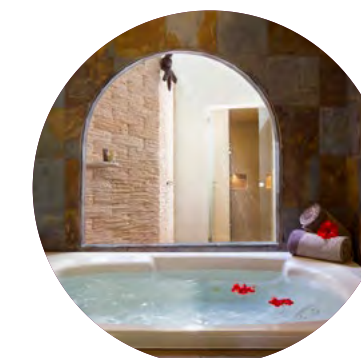
Romantically Decorated Suite