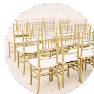
Up to 60 Gold or Silver Chiavari Chairs