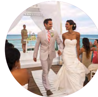
Only Wedding On Site During Your Stay

Have the destination wedding of your dreams with these Exclusively You ceremony inclusions: