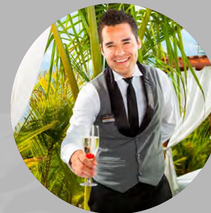
Access to a Private Butler and Cellphone to Always Stay Connected.