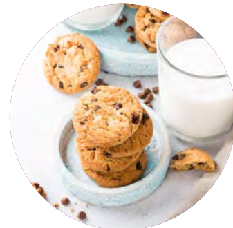
Cookies and Milk turn down service for kids, delivered daily or nightly.