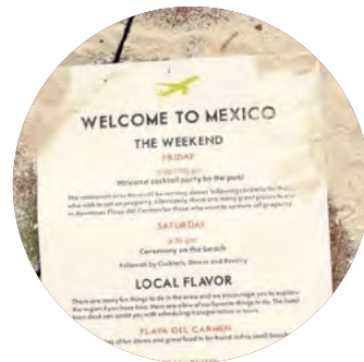
Personalized welcome letter and group itinerary.