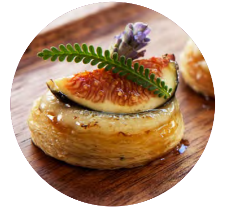
Groom's room day of ceremony for the men to get ready in, stocked with premium drinks and gourmet bites.