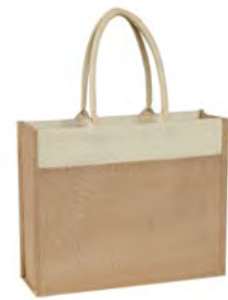
Azul Beach Resorts beach bag given to guests upon arrival.