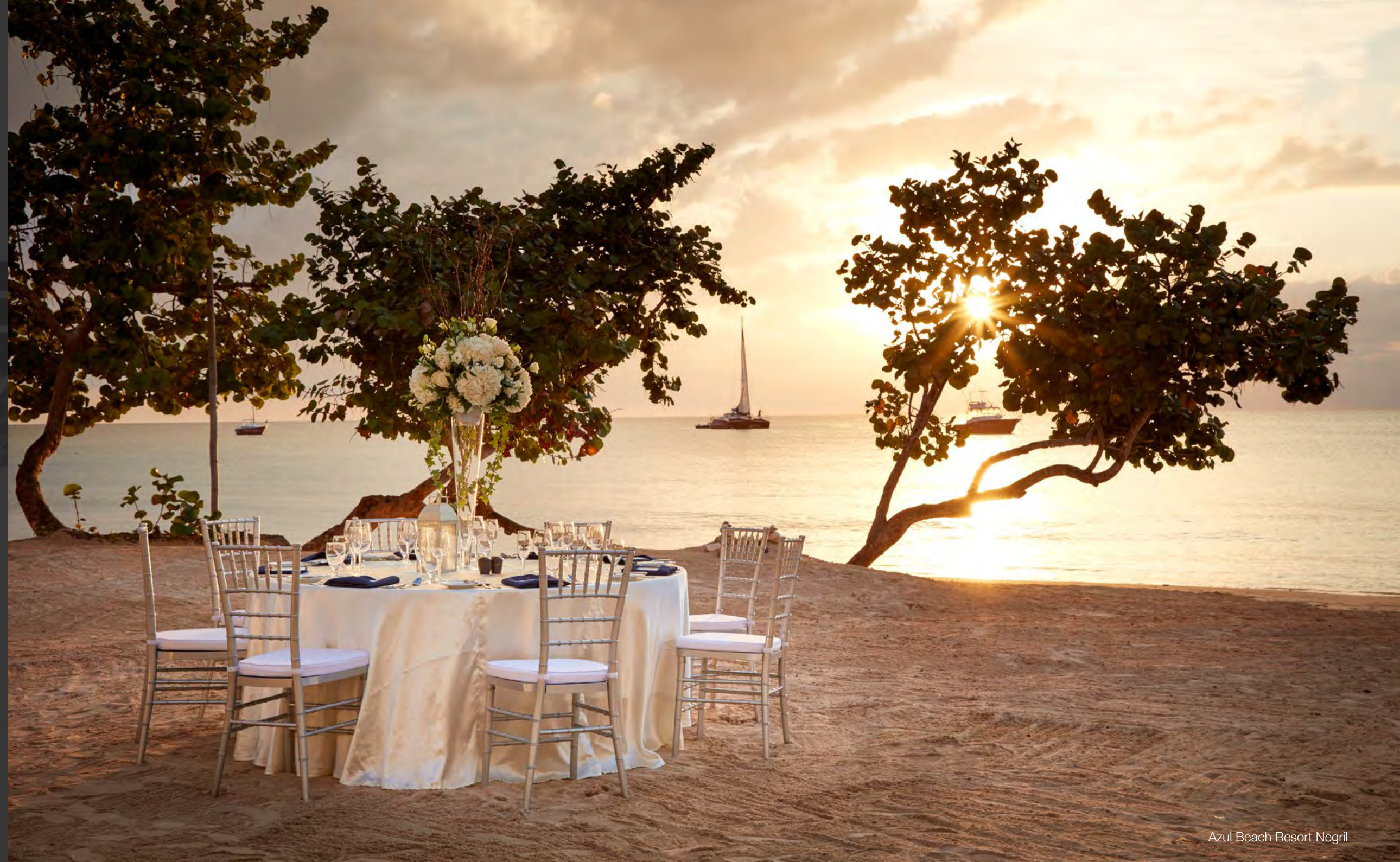
Azul Beach Resort Negril

FEEL LIKE THE ONLY TWO PEOPLE IN THE WORLD on your wedding day