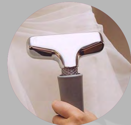
Attire Attendant to Tend to Wedding Garments if Needed.