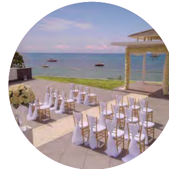
Guaranteed Premium Wedding Location