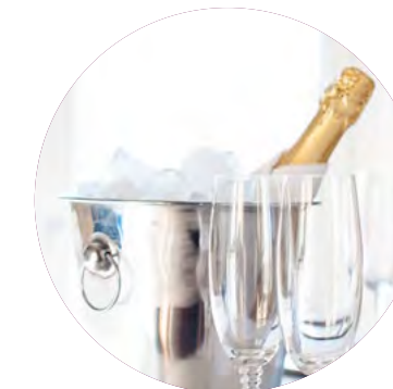
Chilled Bottle of Champagne In-Suite