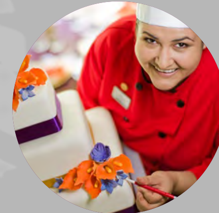
A 2-Night Personalized, Private Destination Wedding Dress Rehearsal.